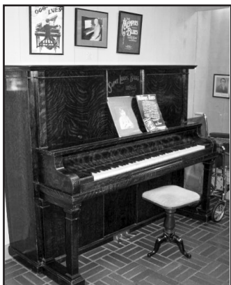
W.C. Handy's Piano

William Christopher (“W.C.”) Handy was born in 1873 in Florence, Alabama. He described his birthplace in his autobiography as, “where the Tennessee River, like a silver snake, winds her way through the red clay hills of Alabama, sits high on these hills my hometown, Florence. Here I came into the world...” Handy held his hometown in high regard, even conveying ownership of his home, a log cabin, and personal items to be displayed in the home, to the City of Florence.